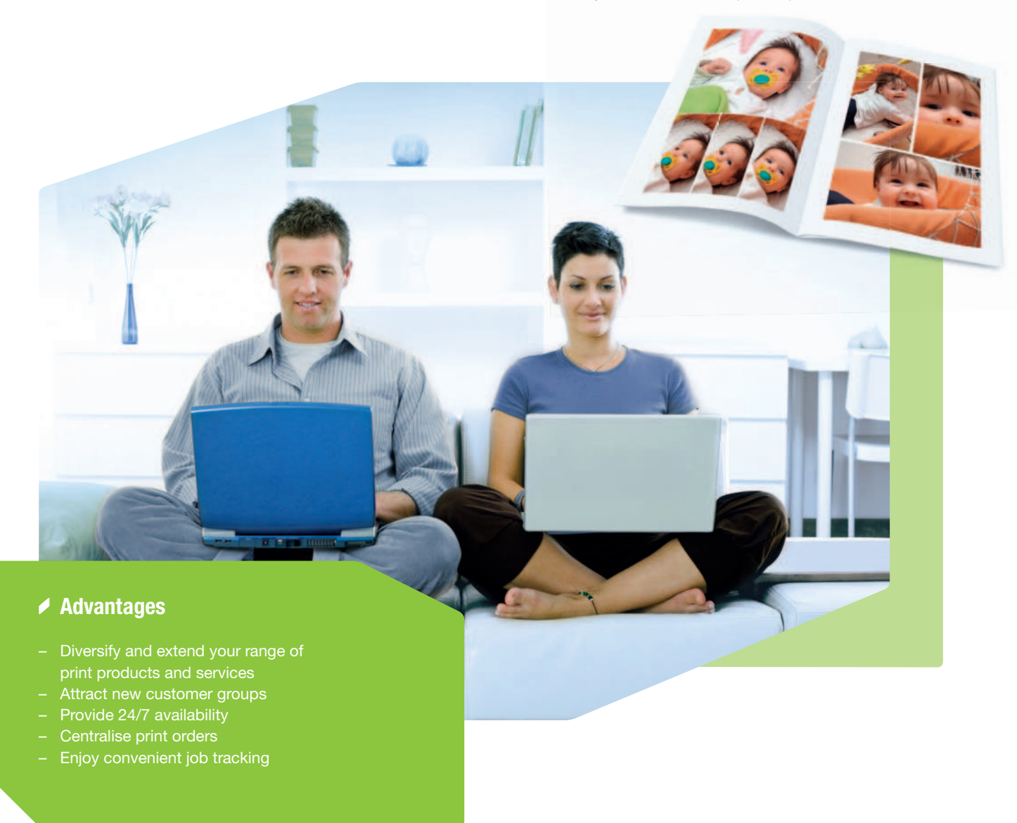
Photo book creation is an easy and attractive enhancement of your online print offering. Via a photo book application, you provide your customers with easy yet extensive online layout possibilities to create albums or calendars with their photos of holidays, events and other occasions. Similar to other web-to-print applications, photo book software includes online submission, payment and tracking, right down to the final delivery or collection of the printed photo book.